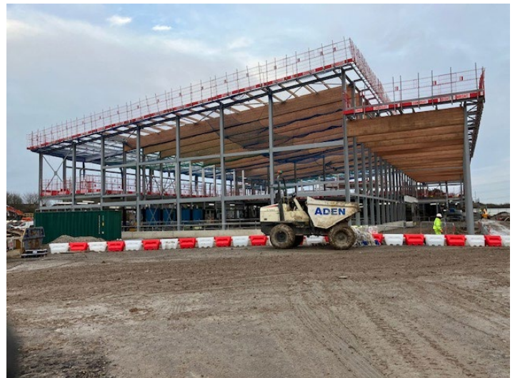
Glulams and Steel Frame